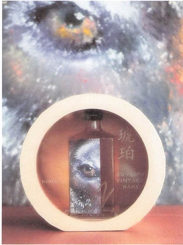
KOHAKU Lot 03/03 (Gold Urushi)